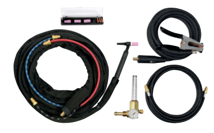
#300 990 kit shown.